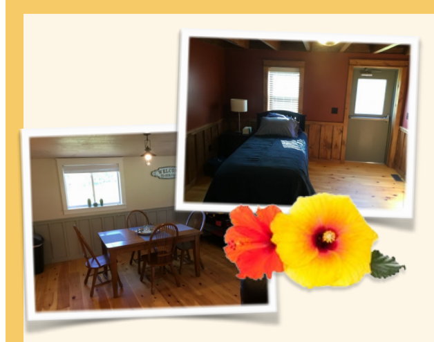
Living areas within The Path Home. Every guest is given their own room with access to common areas.

The Path Home offers a stay of up to five days to assist in gaining and developing new skills to maintain your wellness. Peer Specialists are available 24 hours a day, 7 days a week to address the needs of guests as they arise. Participation in the program is completely voluntary and free of charge. Guests may come and go as they please. We will also maintain contact and support for our guests at their request after they finish their stay.